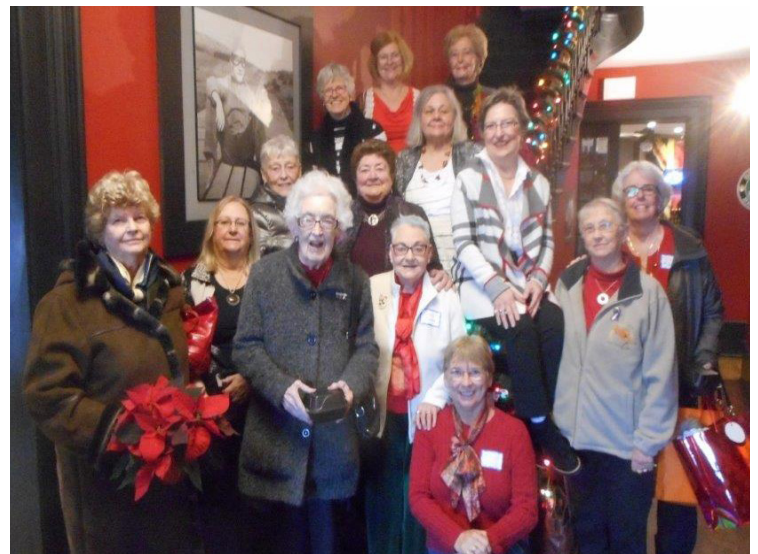
Alma Alumnae London Branch Christmas gathering at Crossings Restaurant in London