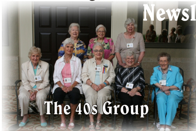
The 40s Group