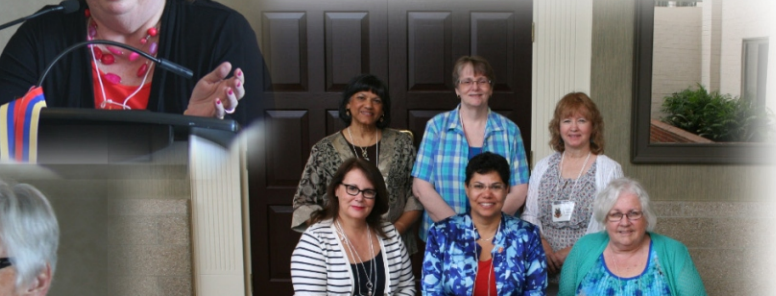
The 70s & 80s Group