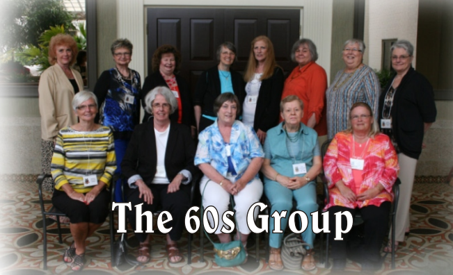
The 60s Group