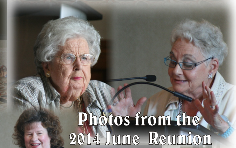
Photos from the 2014 June Reunion