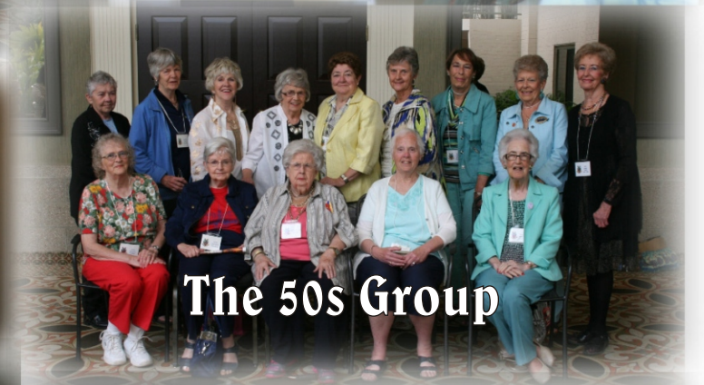
The 50s Group