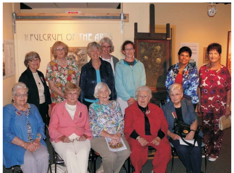
Alma Alumnae in attendance at the exhibit opening

http://www.relishelgin.ca/20/post/2013/09/alma-collegeinfluence-oncanadian-culture-explored-in-new-exhibit-at-elgin-county-museum.html 09/08/2013